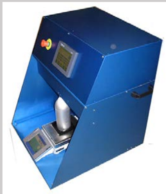
Profile View of Blender cabinet

3 or 4 Inputs for OCTANE 2 Inputs for CETANE