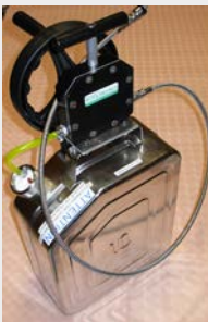
Fuel Pump Assembly system

Manual filling with ROFA France Fuel pump system code: JP-01