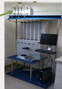
Blender without burettes & Pumps / Blender with burettes (Gravity)

Special fuel valve input option for this option